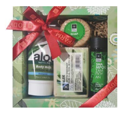
09806 mini G.SET Aloe body milk nat. 75ml Soap Aloe100g Soap Olive 30g Shampoo Olive 40ml