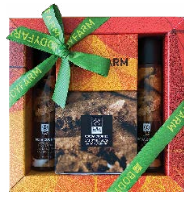
09989 mini G.SET COCOA COOKIES Shower gel 50ml Body milk 50ml Soap 110g