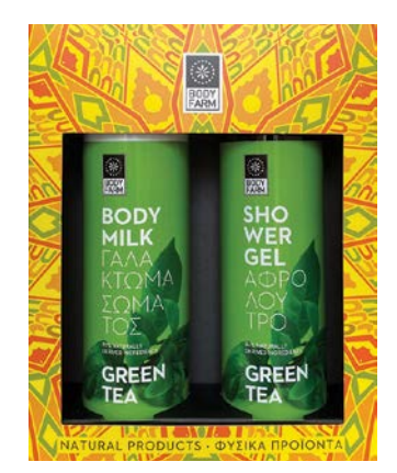
09330 GIFT PACK Green tea