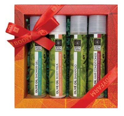
51014 mini G.SET OLIVE OIL Shower gel 50ml Shampoo 50ml Body milk 50ml Conditioner 50ml