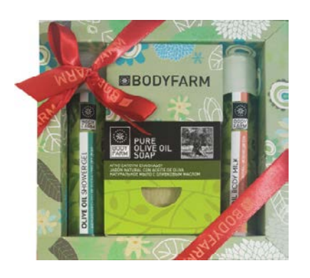
09996 mini G.SET OLIVE OIL Shower gel 50ml Body milk 50ml Soap 150g