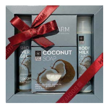
09983 mini G.SET COCONUT Shower gel 50ml Body milk 50ml Soap 110g