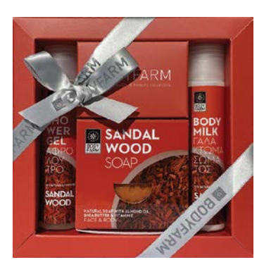
09990 mini G.SET SANDALWOOD Shower gel 50ml Body milk 50ml Soap 110g