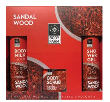
09902 GIFT PACK SANDALWOOD Shower Gel 250ml Body Milk 250ml Scrub 200g