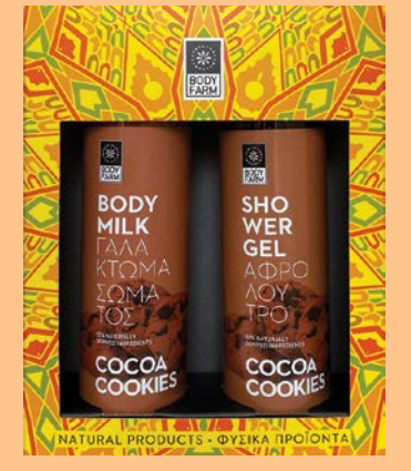
09355 GIFT PACK COCOA COOKIES