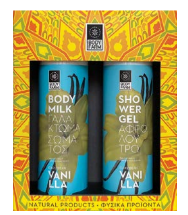
09379 GIFT PACK VANILLA CARIBEAN