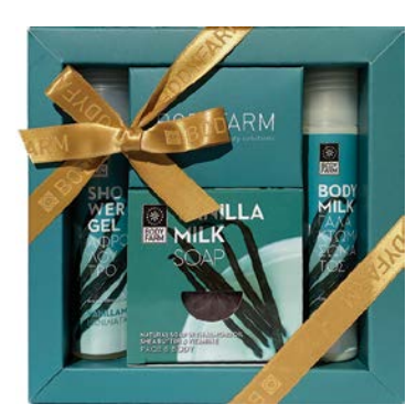
09992 mini G.SET VANILLA MILK Shower gel 50ml Body milk 50ml Soap 110g