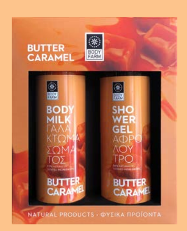
09356 GIFT PACK BUTTER CARAMEL