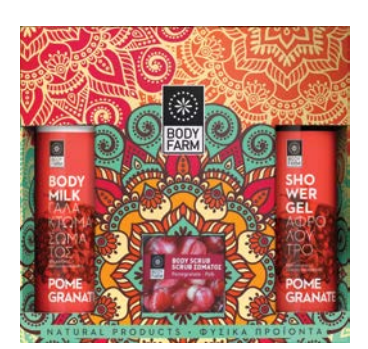
09900 GIFT PACK POMEGRANATE Shower Gel 250ml Body Milk 250ml Scrub 200g