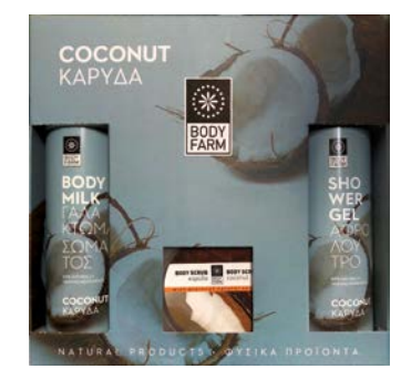
09904 GIFT PACK COCONUT Shower Gel 250ml Body Milk 250ml Scrub 200g