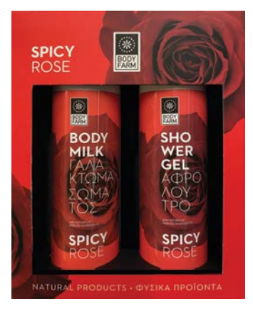
09376 GIFT PACK SPICY ROSE