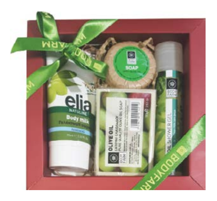
09816 mini G.SET Elia body milk natural 75ml Soap olive 100g Soap 30g Shower gel olive 50ml