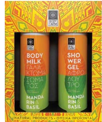
09377 GIFT PACK MANDARIN & BASIL