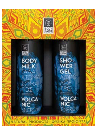
01609 GIFT PACK VOLCANIC