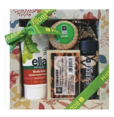
09814 mini G.SET Body Milk Sand 75ml Soap olive 30ml Soap Cinam 100ml Shower Dark Chocolate 40ml