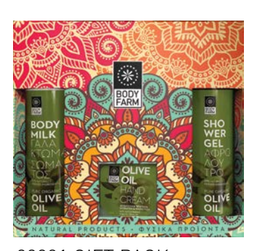
09801 GIFT PACK OLIVE OIL Shower Gel 250ml Body Milk 250ml Hand cream 200ml

09903 GIFT PACK MANGO Shower Gel 250ml Body Milk 250ml Scrub 200g