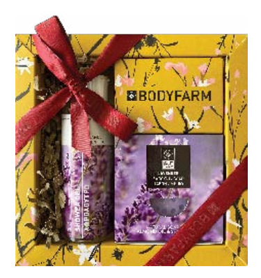
09920 mini G.SET LAVENDER Shower gel 100ml Soap 110g

09999 mini G.SET WHITE MUSK Shower gel 50ml Body milk 50ml Soap 110g