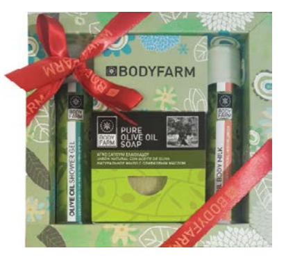
09998 mini G.SET OLIVE OIL Shampoo 50ml Conditioner 50ml Soap 150g